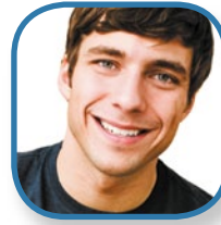
John the customer

Spindle Professional's flexibility means that all relevant people, departments and systems automatically receive copies of documents